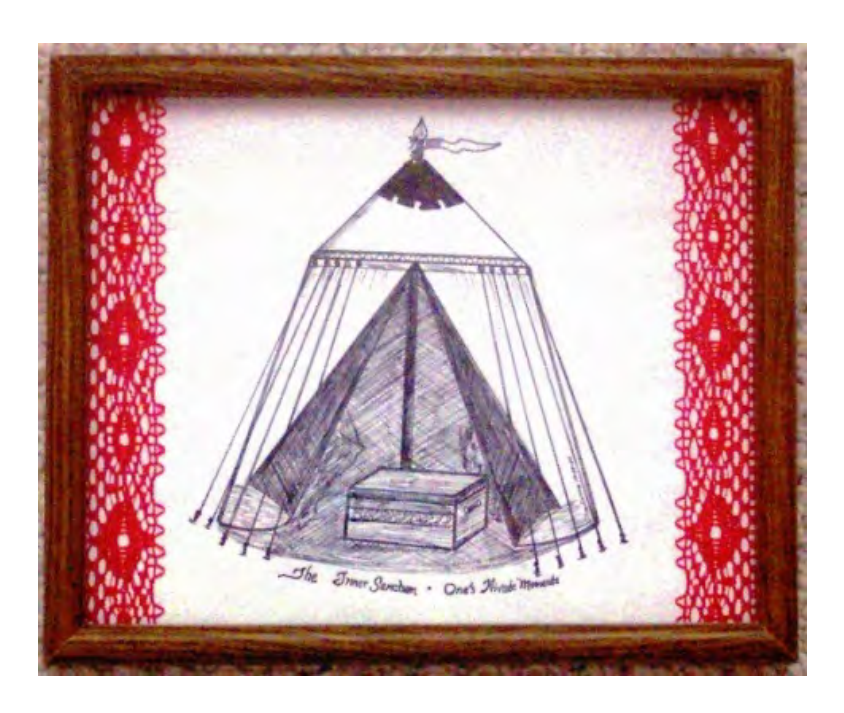
© Original Black Ink Design Created ~by Maureen

← Waterfall — Frank Lloyd Wright Inspired Needlepoint Design: 7 x 13" & Created ~by Maureen