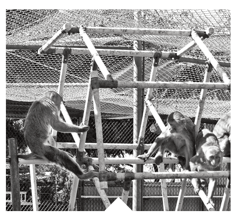
NONHUMAN PRIMATES USED IN MEDICAL RESEARCH

Monkeys are often involved at the later stage of the process what is called translational or applied research. Here all of the knowledge accumulated earlier is applied to specific medical